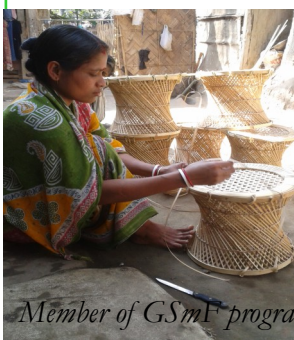
Member of GSmF program

‘ To improve the quality of life of the poor and disadvantaged people in rural, semi-urban and urban areas through development and liveli-hood promotion actions and support.’