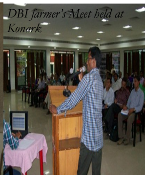
DBI farmer's Meet held at Konark